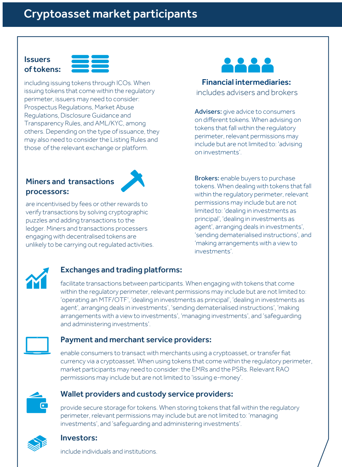
Figure 2: Cryptoasset value chain